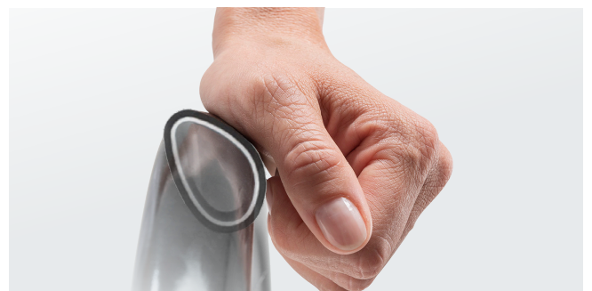
Optional coated pushrim with ergonomic shape for users with limited hand or triceps function (e.g. Quadriplegics)