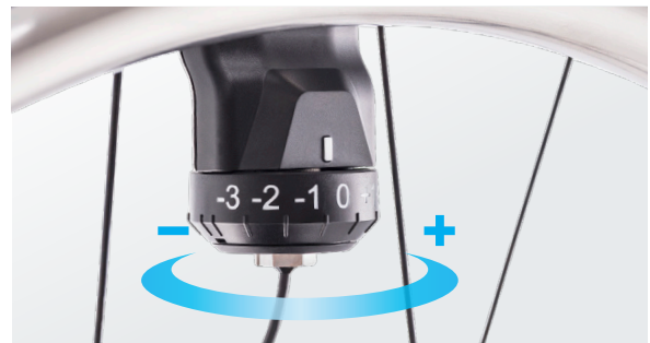
Adjustable sensitivity of the drive sensor in seven increments